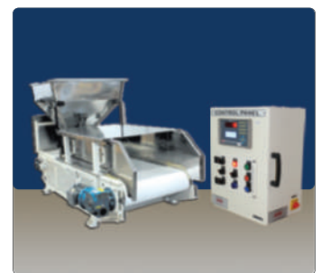
Model : AWSFS-BF ( Detergent, Chemical, all types of powder )