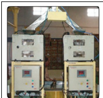
Model : AWSFS-GF (Tea, Dhall, Rice, all free-flow Granulars)