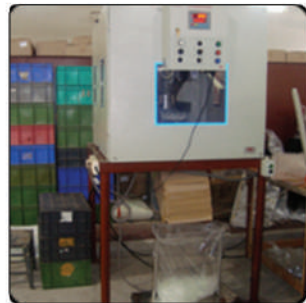
Model : AWSFS-VF (Atta, Turmeric powder, Small components)